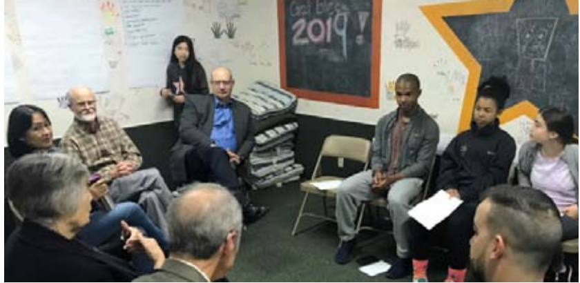
January 27 meeting with parishioners helps to define outreach project.