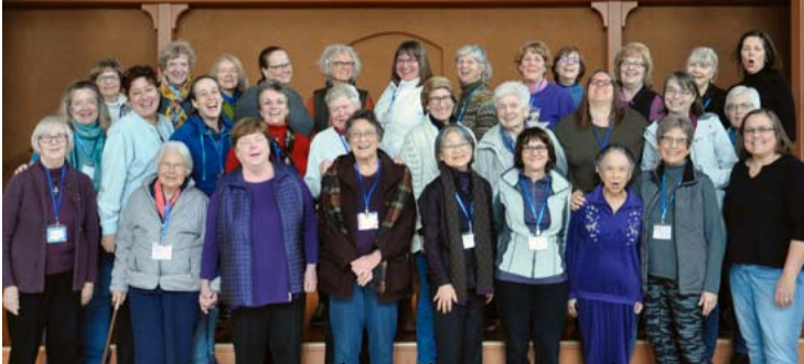
2018 Women's Retreat was a blast. focus is on how we can be the Good

Don't miss an amazing opportunity to explore this topic, bond with the women of St. John's, and enjoy Bishop's Ranch.